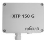
XTP 150G Sensor