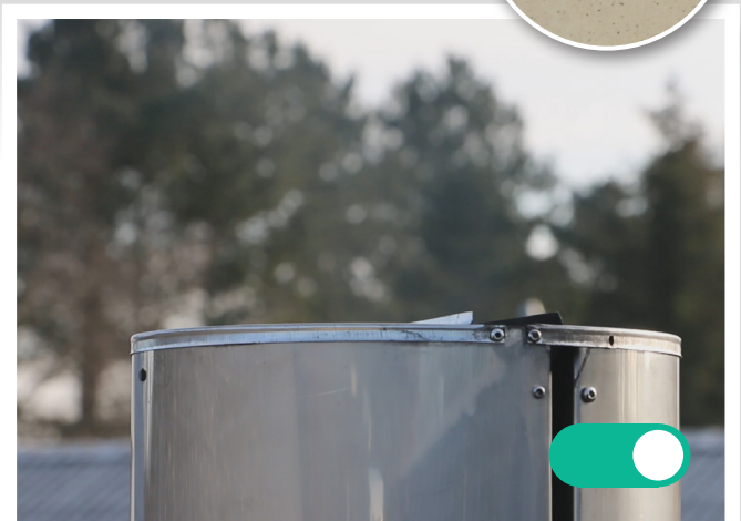
PARTICLE FILTER ON