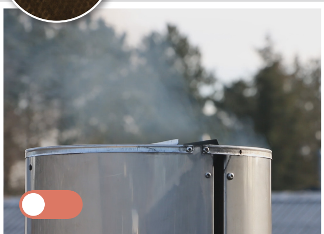
PARTICLE FILTER OFF